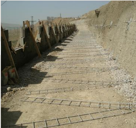
Friction Link system with steel strips

The TerraLink™ technique allows the construction of Reinforced Earth® walls in front of existing structures, with narrow space between them. Since the reinforced fill zone is not wide enough to accommodate conventional lengths of reinforcements, the acceptable solution consists in connecting the Reinforced Earth mass to the existing structure. The whole configuration, called TerraLink™, forms a shored retaining wall that ensures a sound structural behavior.