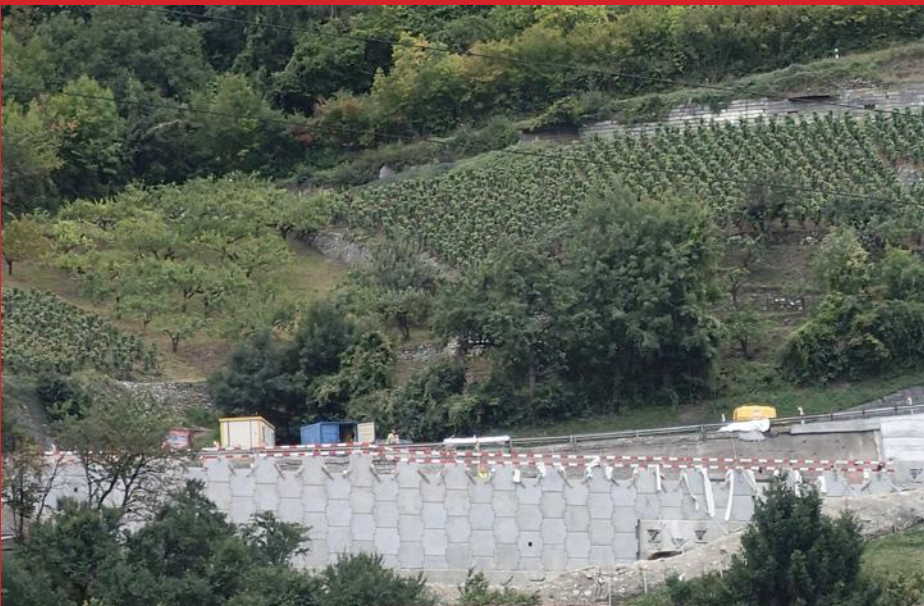
RC 62 near Sion, Switzerland