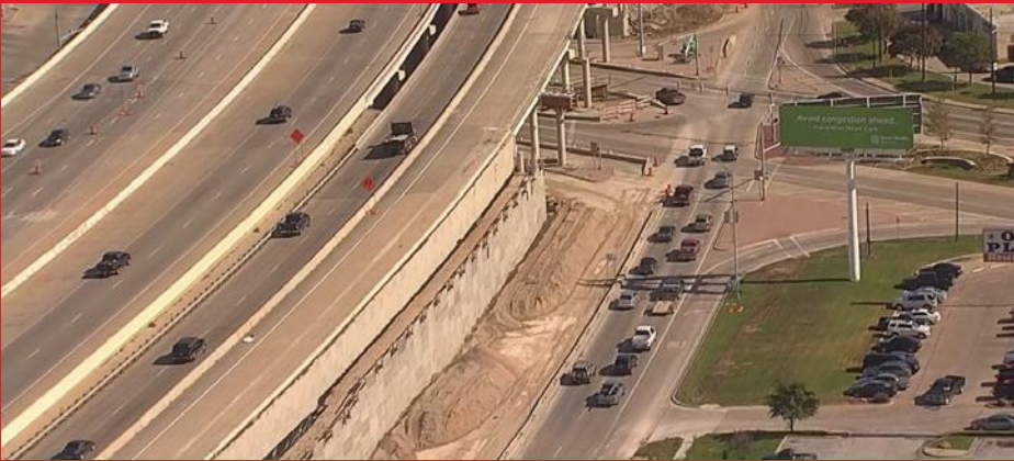
North Tarrant Express near Dallas, Texas, USA