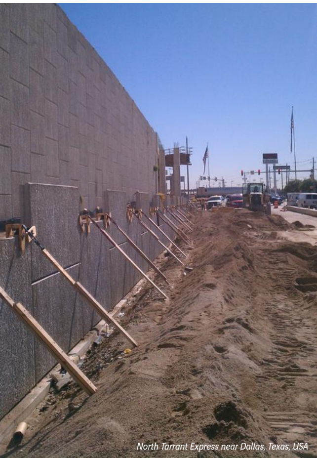
North Tarrant Express near Dallas, Texas, USA