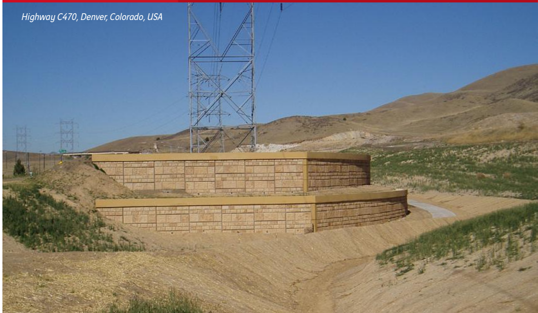
Highway C470, Denver, Colorado, USA