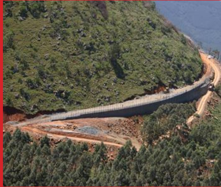
Langeni, South Africa