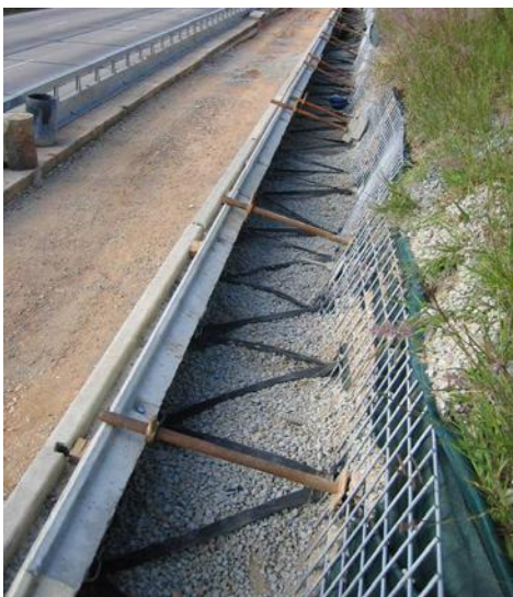
Direct Link system with synthetic strips

The reinforcements of the Reinforced Earth® wall are directly connected to the existing structure. This solution easily adapts to very narrow or limited space but requires further precautions in terms of construction.