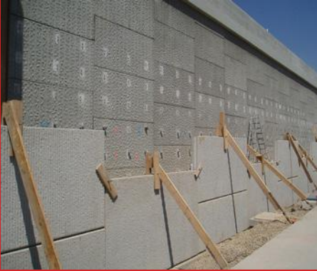
I-215 On-Ramp to Southbound I-15 Ramp widening, Salt Lake County, Utah, USA