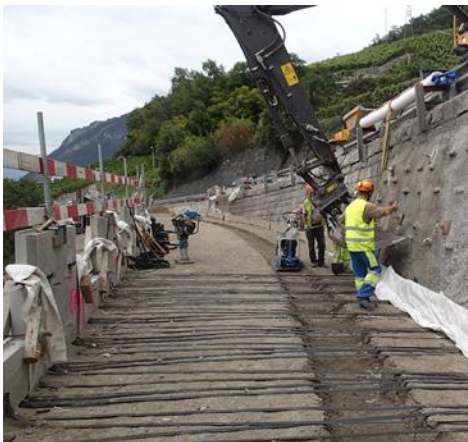
Friction Link system with synthetic strips

TerraLink™ elements are similar to those used for Reinforced Earth® solution: soil reinforcements (steel or geosynthetic), connected to modular facing systems (precast concrete panels, welded wire mesh and connection parts). These elements are placed between well compacted backfill layers. The main feature is that reinforcements are linked to the rear part (backface) of the system through the existing structure, which enables combination or continuity of the reinforcements between the narrow Reinforced Earth® wall and the existing structure.