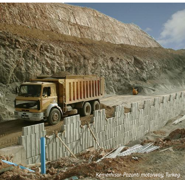
Kemerhisar-Pozanti motorway, Turkey