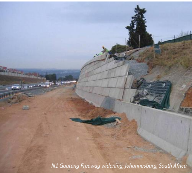
N1 Gauteng Freeway widening, Johannesburg, South Africa